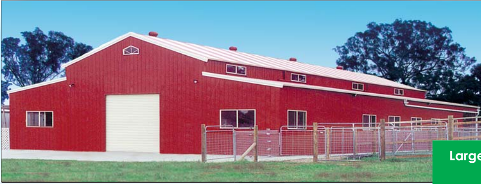
Large American Barn