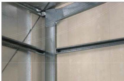
Fire Rated Walls