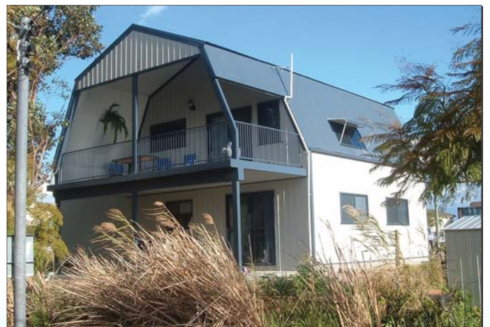
Quaker Barn with verandah