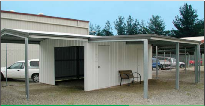
Garage with Garaport and lean-to 10