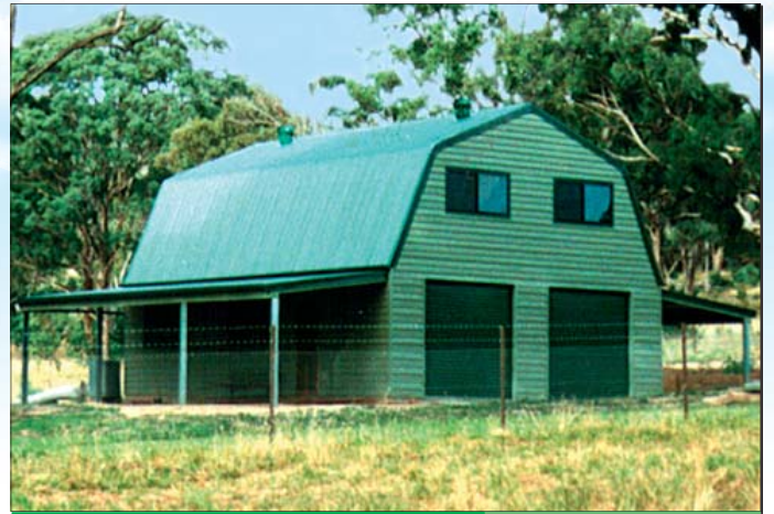
Quaker Barn with 2 side lean-to's