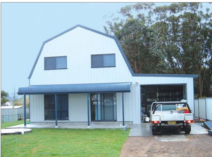
Quaker Barn with closed-in lean-to