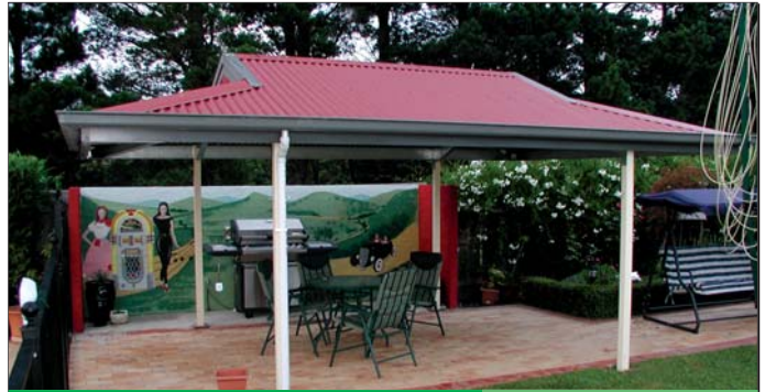
Dutch gable carport 11