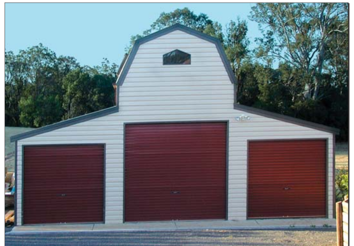
American Barn with mansard /quaker barn roof