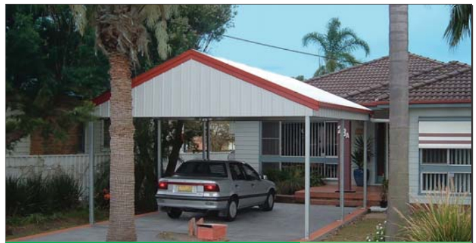
Pitched roof Carport 13