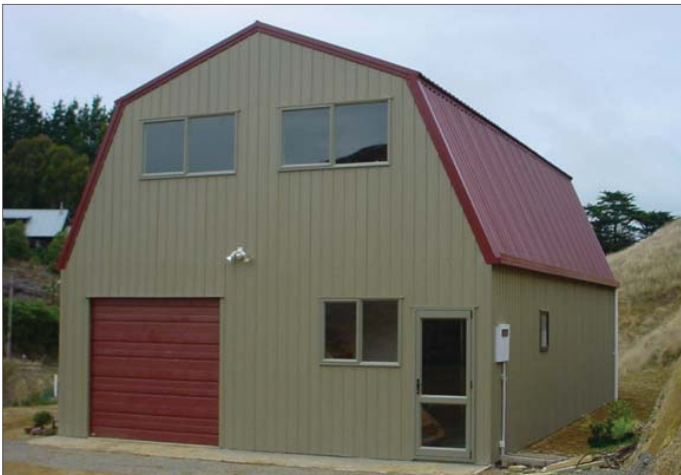
Quaker Barn with 1 roller door