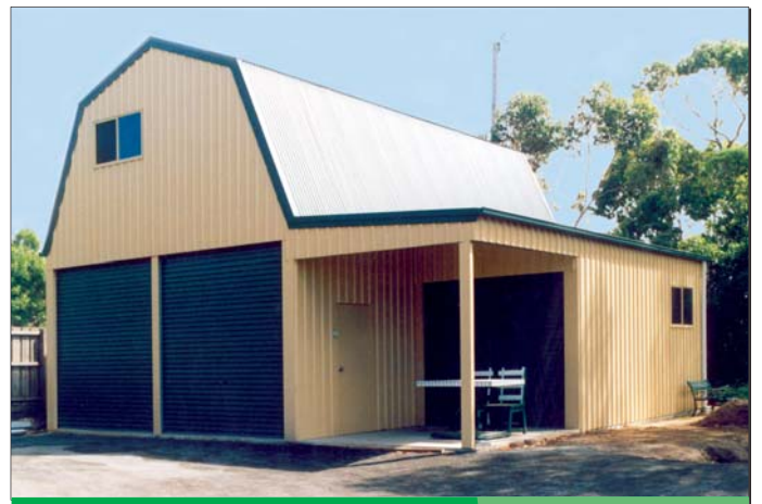
Quaker Barn with partially closed-in lean-to