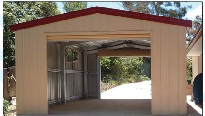
Single Garage with roller doors front & rear