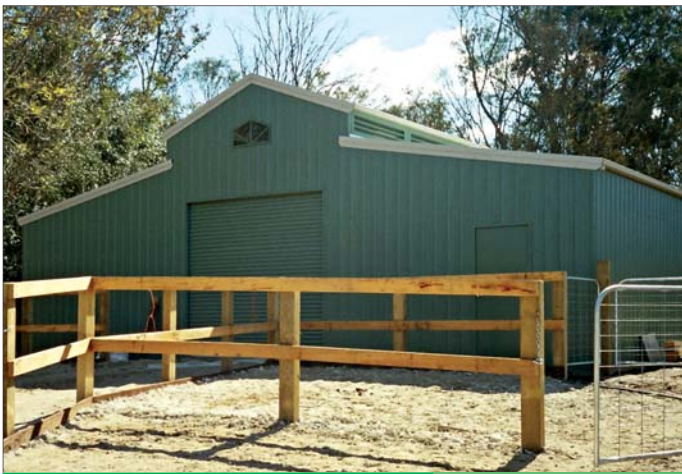
American Barn with one roller door