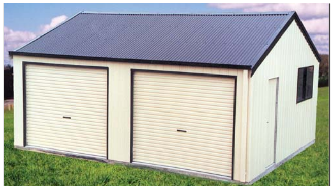
Double Garage with roller doors on gutter side