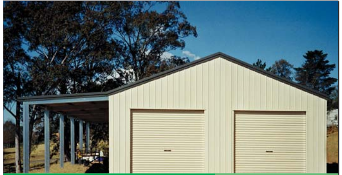
22° pitch Garage with side lean-to 09