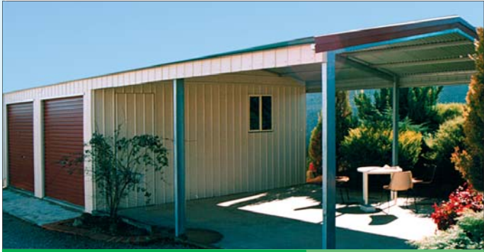
Garage with roller doors on gutter side and 2-bay Garaport 08