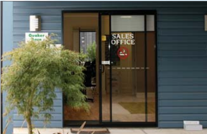
Glass Sliding Door