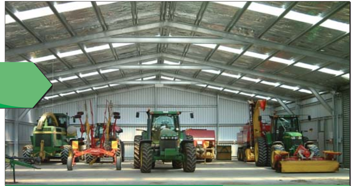
Internal view of Industrial building