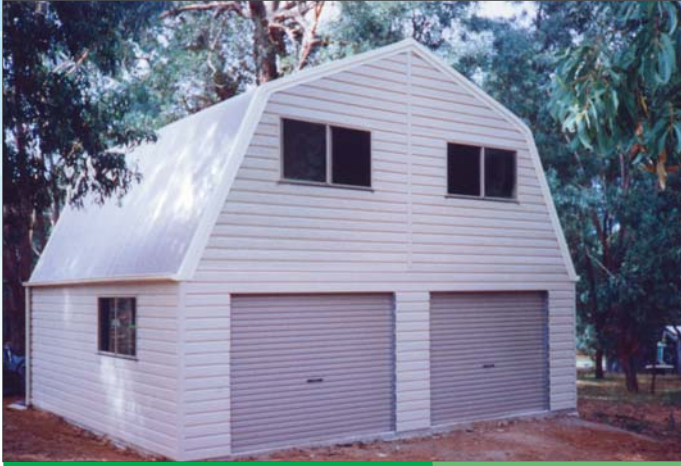
Quaker Barn with 2 roller doors