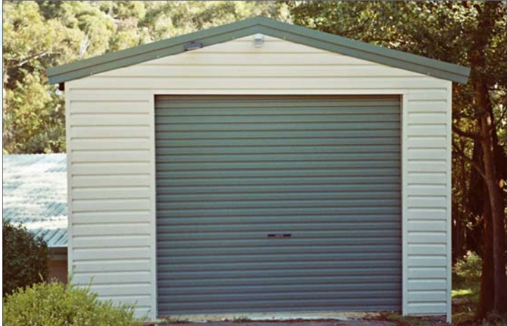
Single Garage with horizontal cladding