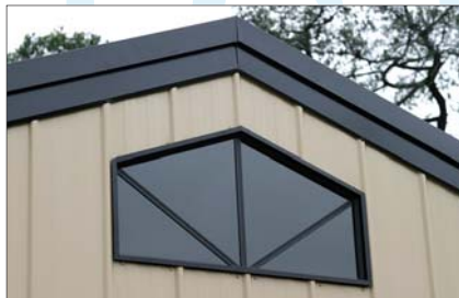
Barn Style Window