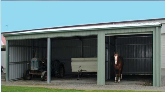
3 bay Farm Shed with roller door in one bay