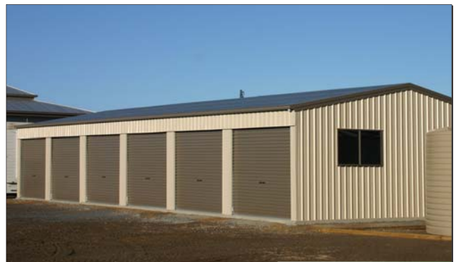
Multiple Car Garage