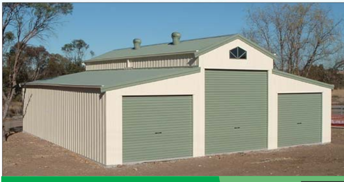
American Barn with 3 roller doors