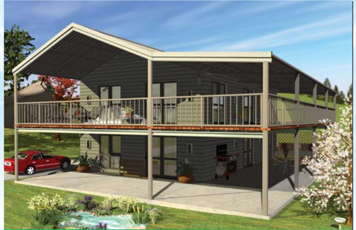
The Entertainer ENT