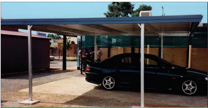
Flat roof Carport 12