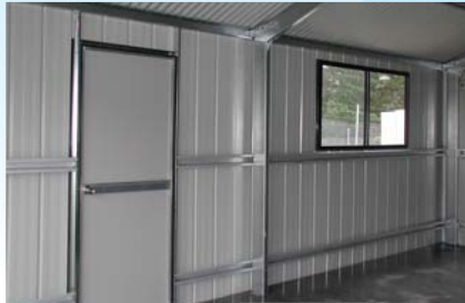
PA Doors & Windows