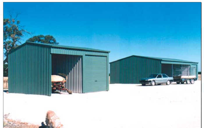
Open Farm Sheds with enclosed bays