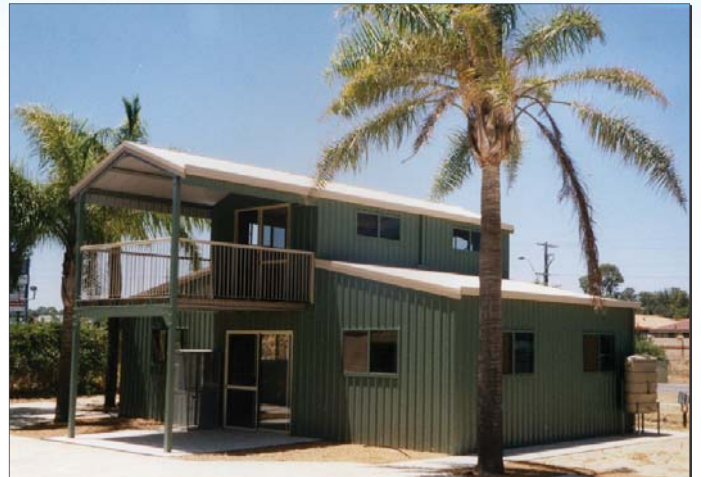
American Barn with Garaport