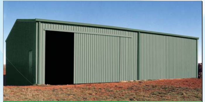
Farm Shed with sliding door